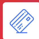
ACH / Credit Card Payments