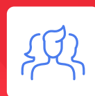
User & Roles Management