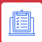
Dashboards & To-Do Lists