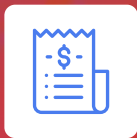
Accounting & Financial Management