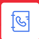
Lead & Contact Management