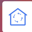
Lead To Tenant Cycle