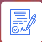
Customer & Contract Management